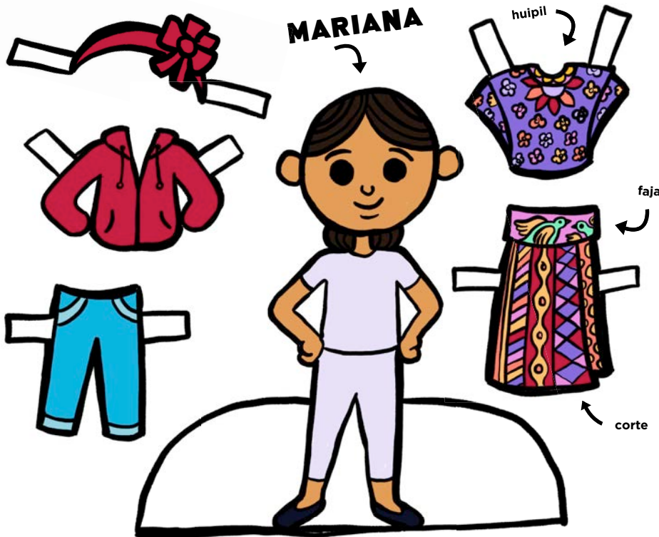
Mariana wears traditional clothing of Guatemala: a huipil (a type of blouse), a corte (a skirt) and a faja (a belt). Every region in Guatemala has its own color, pattern and design.

In Ghana, fabrics are skillfully woven into different patterns based on people's tribes and the areas in which they live. The Ga people make up one of the largest groups of people in Ghana. Their culture's traditional clothes are colorful and unique!