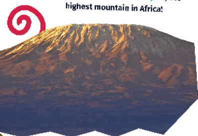
→ 19,341 feet tall! →

Some animals that live here: elephants, zebras, giraffes, rhinoceroses, lions, leopards, crocodiles, hippopotamuses, wildebeests and pangolins.